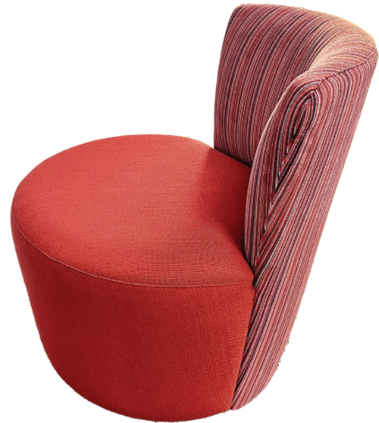
Ottoman Chair Backrest in Bingo Port Seat in Bolt Chili

Ottoman Chair OTTCHR 750 H X 608 W (Seat 450 H)