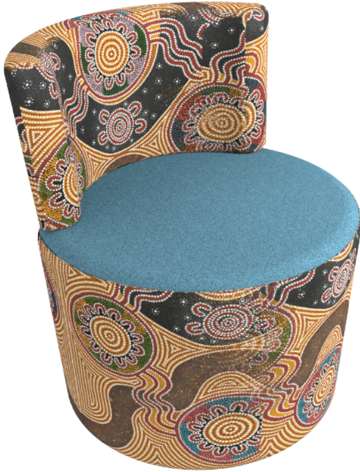
Ottoman Chair Base & Backrest in Our Storytellers and the Knowledge Holders Fabric Seat Top in Beachcomber Atlantic

Essentially an ottoman with back support, this versatile chair is designed to look good wherever it sits. Use in clusters, or randomly place across the floor. Due to its shape and size, it doesn't need to be used with a table, though we think it looks great teamed with our Laptop Tables (see Tables).