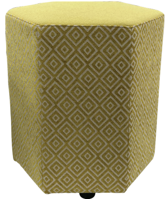
Hex Ottoman 450 in Palm Beach Saffron & Bolt Lemongrass