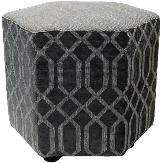
Hex Ottoman 350 in Sarasota Iron & Bolt Aluminium

Available in two sizes, which can be combined to create interesting configurations, or used individually. Constructed from high density foam with a timber base.