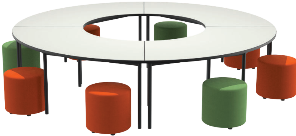
4 x Large Curved Tables In White with Black Edging & Frame, 8 Round Ottomans In Studio Encore Grasshopper and Tangerine

Available in two heights. Pictured below is a set of four tables. Select edging colour to match or contrast table top. Ottomans sold separately (see Lounges).