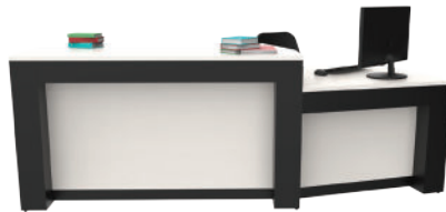
Reversible Options Available: ACCENTV3R

CABLE OUTLET 80mm DIA plastic spring loaded